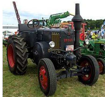
Ursus C 45

The Ursus Factory was founded in Poland in 1893 on 15 Sienna Street, Warsaw, by three engineers and four businessmen. It began producing exhaust engines and then later trucks and metal fittings intended for the Russian Tsar.